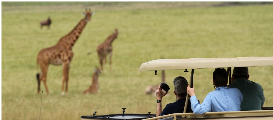
Game viewing in Akagera National Park

If you are a large group planning to visit in a bus, note that buses larger than a coaster are NOT allowed to drive in Akagera. Every bus, including minibuses, are required to take a guide when entering the park, at their own cost. The recovery fee for assisting coasters is $150 and during the rainy seasons coasters will not be allowed to enter low-lying areas such as Kilala, Mohana and Giraffe Area which are prone to flooding.