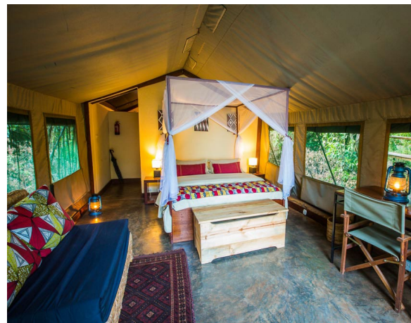
Ruzizi Tented Lodge