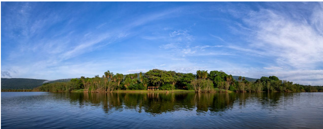
Ruzizi Tented Lodge from the water

As the only protected savannah environment in the country, Akagera is unique in Rwanda. Large herds of buffalo and impala, zebra and topi are commonly seen on the open plains, whilst smaller antelope such as oribi, klipspringer, bushbuck and reedbuck exist widely throughout the park. Elephant tend to stay around the lakes which are inhabited by large populations of hippo and crocodiles. Lions roam the northern plains, having grown in number from the seven introduced in 2015 to over 45 individuals that we have in the park today. The reintroduced black rhinos (2017) largely remain in the thickets in the south of the park, while the introduced population of white rhinos (2021) are in the southern and northern plains of Akagera. Baboons and vervet monkeys are commonplace, less so is the secretive blue monkey. Leopard, hyena and jackal are also residents and may be seen on a night drive along with genet, serval, bushbabies, porcupine and other nocturnal wildlife. An important population of sitatunga lives in the papyrus swamps along with other rarities such as the shoebill and other papyrus endemic bird species. These are among the more than 480 bird species found in the park, which make Akagera a haven for bird enthusiasts.