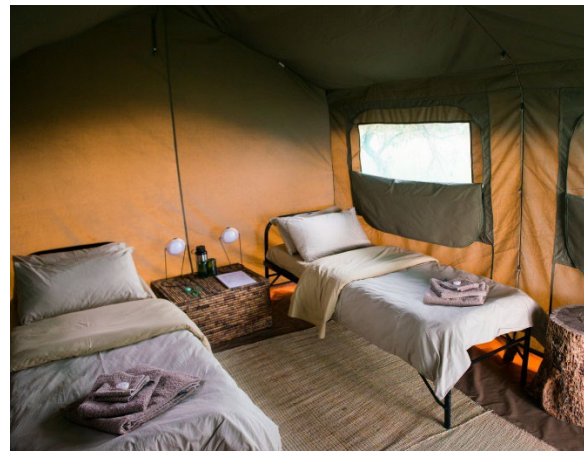
Karengé Bush Camp