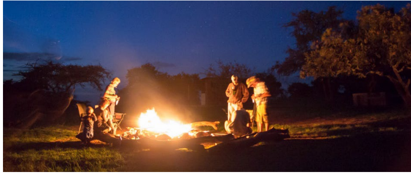
Camping in Akagera

burden of rubbish on the park. Please consider your packing to reduce waste & take all your rubbish with you.