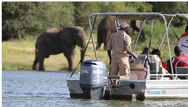
Boat Safaris on Lake Ihema

If you are looking for a variation on the usual safari experience, a boat trip on Lake Ihema will not disappoint. Drift along the forest-fringed lake edge, past huddles of hippo and basking crocodiles. For the serious birder a boat trip is a must. Trips are scheduled four times per day at 7.30am, 9am, 3pm and 4.30pm. Non-scheduled, private, trips can also be arranged between 10.30am to 1.30pm for an hour.